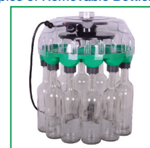
12 x 0.75 litre Glass