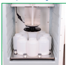
8 x 2.8 litre HDPE