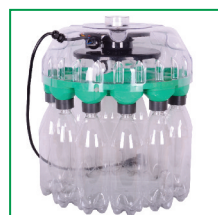
12 x 1 litre PET

Apart from the pluggable connection cable, Removable Bottlers are totally independent of the Aquacell Sampler unit in use. The complete unit can be removed from the Sampler, which is particularly useful when there is the need to remove the full set of Bottles for analysis. Available in glass or plastic with Single Container or Self-Emptying multi-bottle formats to choose from.