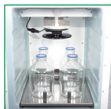
4 x 5 litre Glass