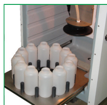
12 x 1 litre HDPE with Pull-Out Tray