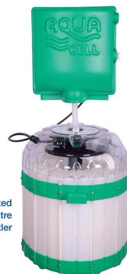
Aquamatic S100 Wall-Mounted Sampler with 24 x 1 litre Removable Bottler