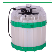
24 x 1 litre HDPE