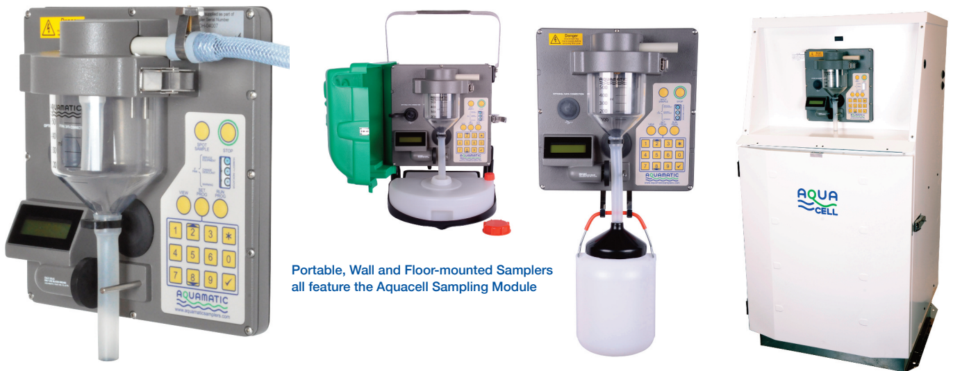
Portable, Wall and Floor-mounted Samplers all feature the Aquacell Sampling Module

Aquamatic Ltd Soapstone Way, Irlam, Manchester M44 6GP, UK t: +44 (0) 161 777 6607, sales@aquamaticsamplers.com www.aquamaticsamplers.com